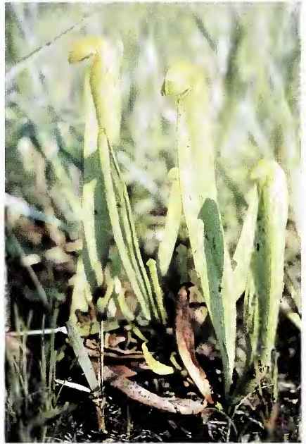
Figure 2. S. minor (green) in burned long leaf pine seepage wetland in southwestern Georgia, June 1994.